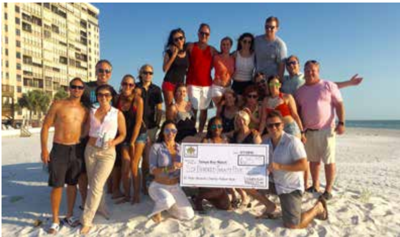
Thank you to The Castle Group for donating the proceeds of their 1 st Annual St Pete Beach Poker Run to Tampa Bay Watch!