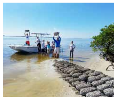
Thank you to Bloomin' Brands who kicked off our Fantasy Island project by assisting us through their Annual Community Service Day.