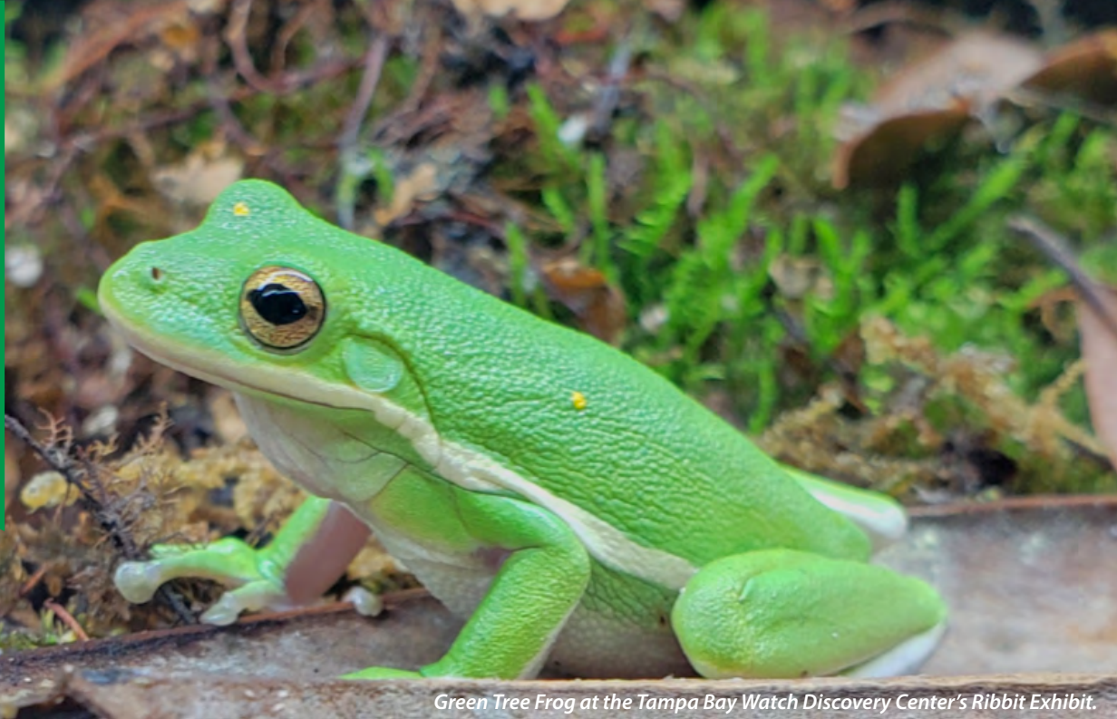
Green Tree Frog at the Tampa Bay Watch Discovery Center's Ribbit Exhibit.